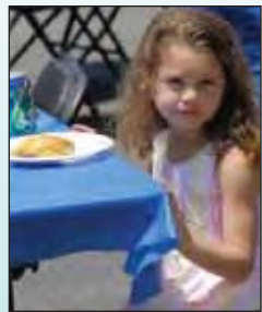
Kentlands Celebrates Memorial Day with a BBQ!