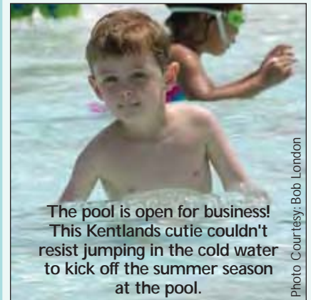
The pool is open for business! This Kentlands cutie couldn't resist jumping in the cold water to kick off the summer season at the pool.

It's that time of year again! The Kentlands community welcomed the start of summer on Memorial Day weekend with the opening of the pool and the traditional Memorial Day BBQ at the Clubhouse. It was a beautiful weekend as hundreds of neighbors stopped in for a dip in the pool while catching up with friends and neighbors they haven't seen since last summer.